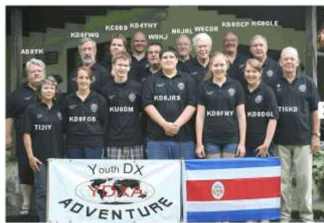
The 2010 YDGA team.