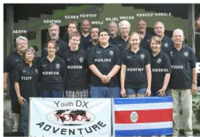
The 2010 YDGA team.