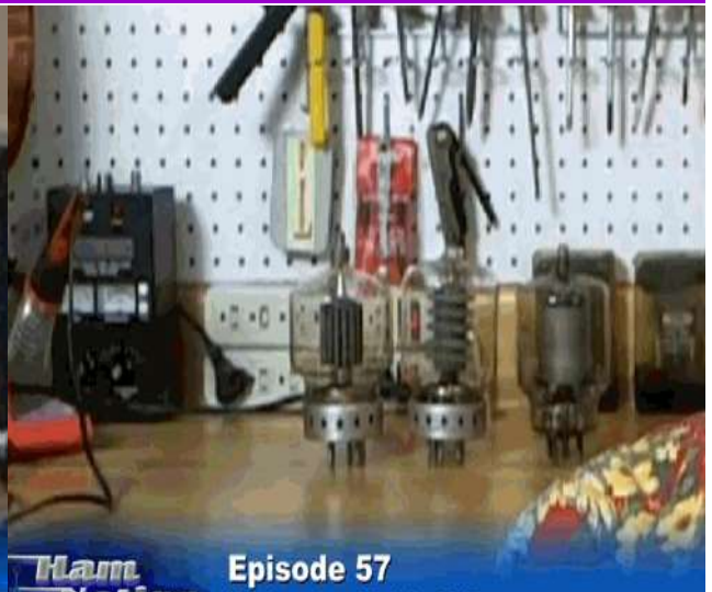
Ham Nation Episode 57