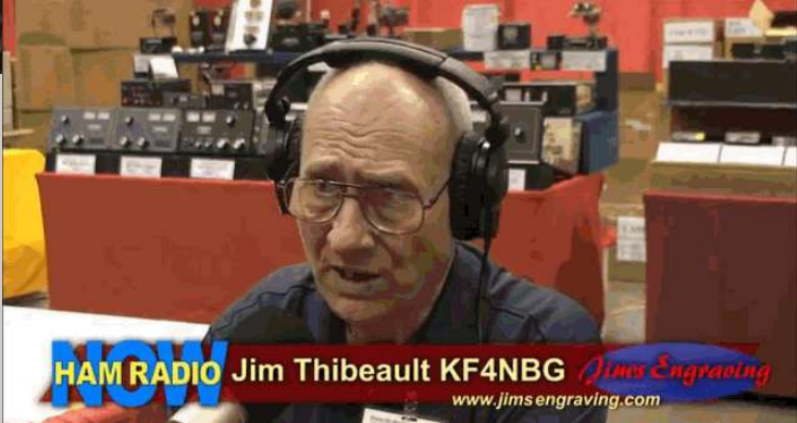
Click here for Ham Radio Now Interview