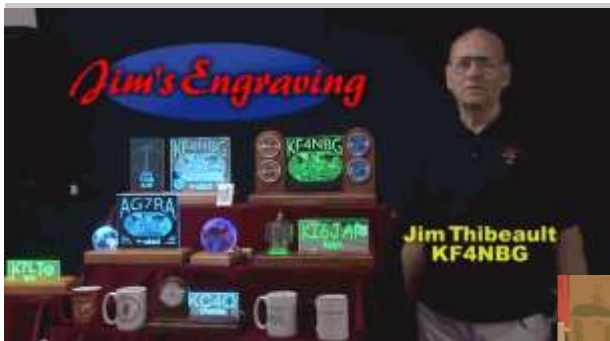
Click here for YouTube Video