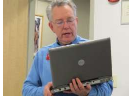
Our Secretary W4GRN hard at work