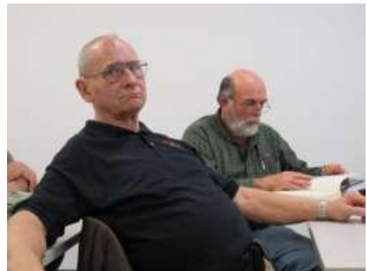
No need to explain this photo! KF4NBG & WB9NEY