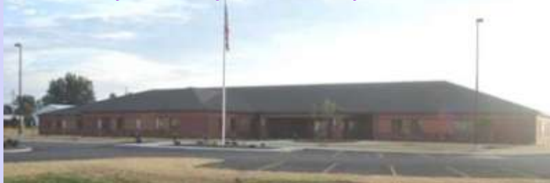
Bond County Health Department Facility-Greenville, Illinois