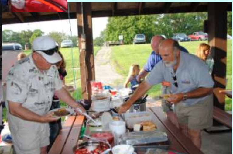
KA9NQL & WB9NEY front & center with KK9N next in line