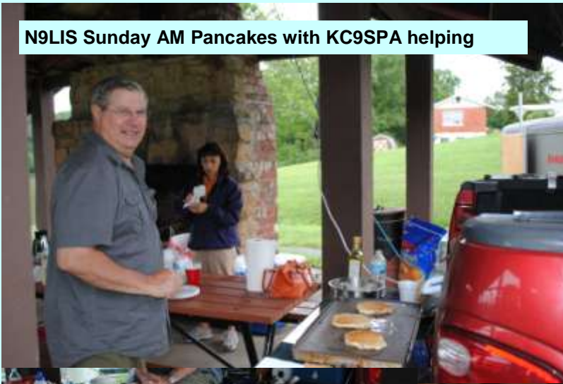
N9LIS Sunday AM Pancakes with KC9SPA helping