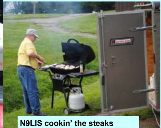
N9LIS cookin’ the steaks