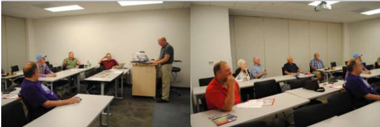
June meeting included Field Day Preparations and Asset Assignments along with instruction for equipment operation