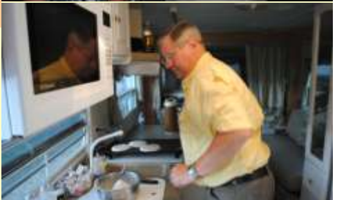
N9LIS cooking Breakfast