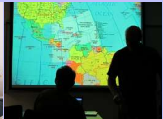
Desecheo Island on the map