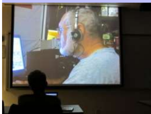
DX-Pedition in operation