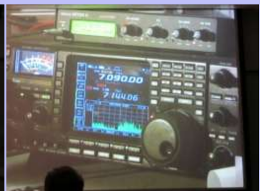
40 Meter CW Rig in operation