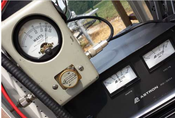
80 watts & 20 Amps @ KB9EGI Repeater